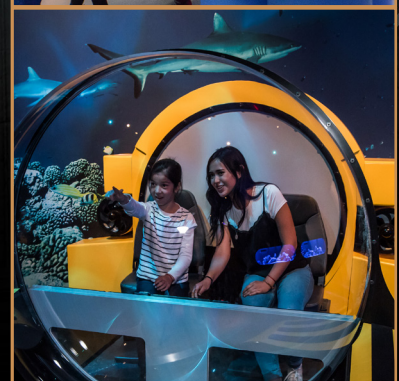
Unseen Oceans is organized by the American Museum of Natural History, New York.

Visit rbc.cardinalhealth.com to register today.