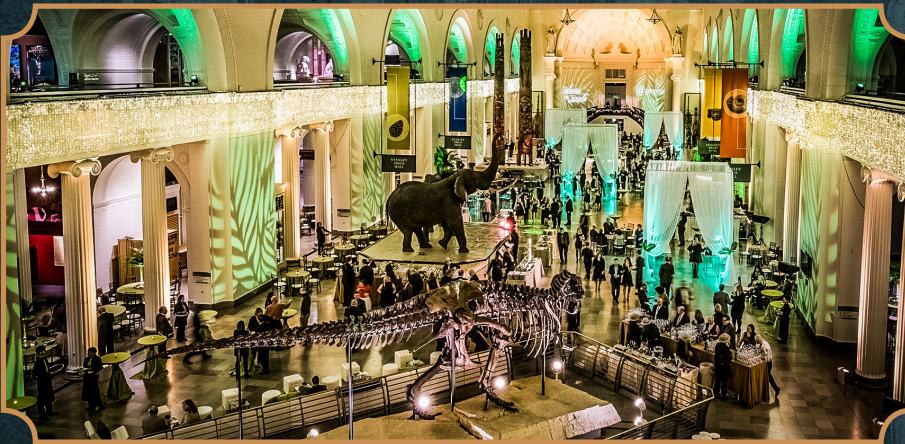
Field Museum Major Sponsor Magellan Corporation.

Each year at RBC, we host Customer Appreciation Night to showcase our appreciation for independent pharmacies' unwavering dedication to their patients and communities.